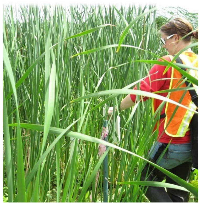
Field work will begin this spring and will include wetland, rare plant, and cultural resources surveys, land surveys, and soil borings.