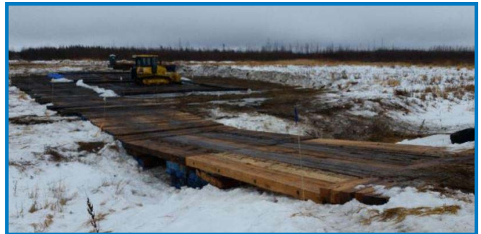
Timber mats protect wetlands and allow heavy construction equipment to cross uneven terrain.