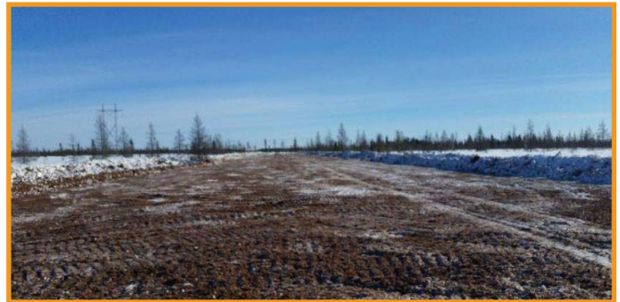
Clearing of the right-of-way and driving ice roads.