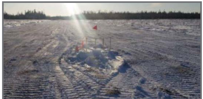
Structure locations are staked and flagged.